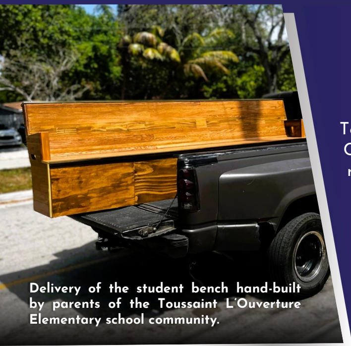
Delivery of the student bench hand-built by parents of the Toussaint L'Ouverture Elementary school community.