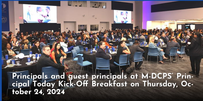
Principals and guest principals at M-DCPS' Principal Today Kick-Off Breakfast on Thursday, October 24, 2024