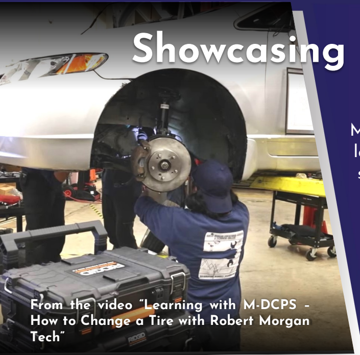
From the video "Learning with M-DCPS - How to Change a Tire with Robert Morgan Tech"

Miami-Dade County Public Schools (M-DCPS) has launched Learning with M-DCPS , a series that showcases the unique and valuable lessons and practical skills our students are acquiring which can be applied in everyday life. From critical thinking to problem-solving and collaboration, students are gaining knowledge that goes beyond the classroom, preparing them for real-world experiences. Click here to check out Learning with M-DCPS on YouTube.