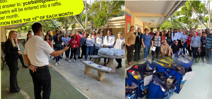
Success Pathways students collect food to donate Thanksgiving baskets.